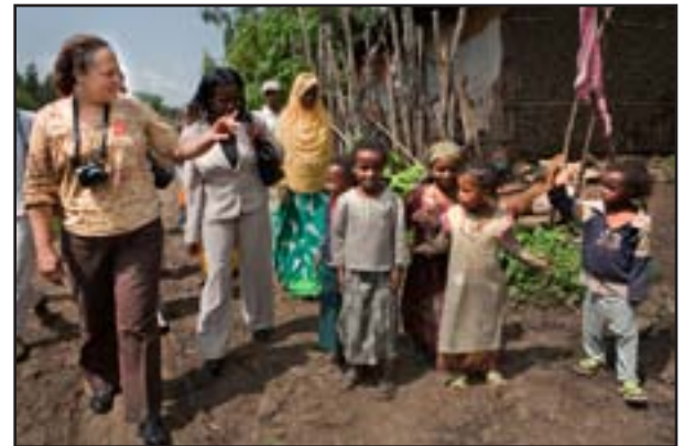
Representative Laura Richardson greets children in Hades Village.

The CARE team spoke about a unique yet simple training approach they use to promote behavior change in households. For example, Hades HEWs target 10 families over a three-month period. Couples learn about family planning, hygiene and sanitation, the importance of educating youth, utilizing the health facility and fostering equitable roles for household chores. Upon completion of the training, they become a "model family." These model families serve as champions within their village, setting a positive example. They spread their newfound knowledge across the community – woman to woman, man to man and family to family. This community-based training creates buy-in at the local level where villagers themselves become part of the solution.