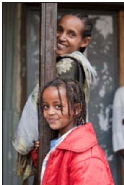
Young girls outside Biruh Tesfa, which means "bright future" in Amharic.