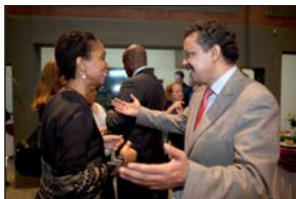
Dr. Helene Gayle greets Dr. Tedros at CARE's New Year Reception.