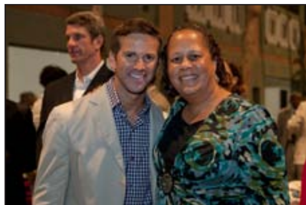
Representatives Aaron Schock and Laura Richardson at CARE's New Year Reception.