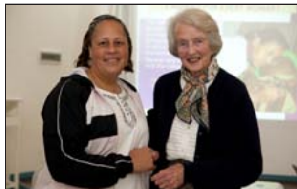
Representative Laura Richardson with Dr. Catherine Hamlin.