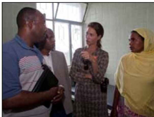
Christy Turlington Burns talks with staff at the Doba Health Center, which serves a population of 48,000 people.

The Doba Health Center serves 48,000 people and is supported by USAID's Integrated Family Health Program (IFHP). Their goal is to provide an integrated package of services to improve the health of mothers, newborns and children under 5. IFHP works closely with the Ethiopian Ministry of Health to strengthen the national Health Extension Program (HEP) and provides supportive supervision and logistical support to Health Extension Workers.