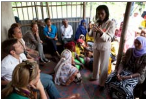
Members of the marginalized women's community group gather to meet with the delegation.