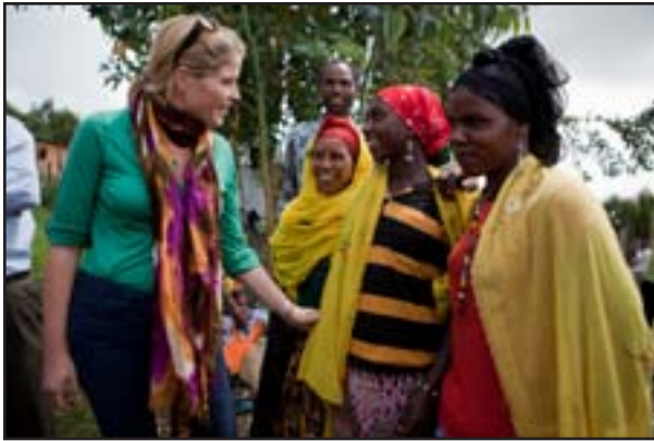
Jenna Bush Hager greets women outside the Hades Health Post.

Hades (pronounced had-is) is a remote rural village. Families there rely on small scale agriculture to survive. The average woman here bears six children, which places a heavy burden on families, communities and a nation facing chronic food shortages. The health post in Hades provides basic, first level care for villagers.