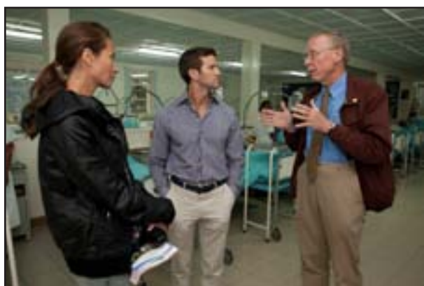
CARE Ambassador Christy Turlington Burns and Representative Aaron Schock tour the surgical ward of the Hamlin Fistula Hospital.