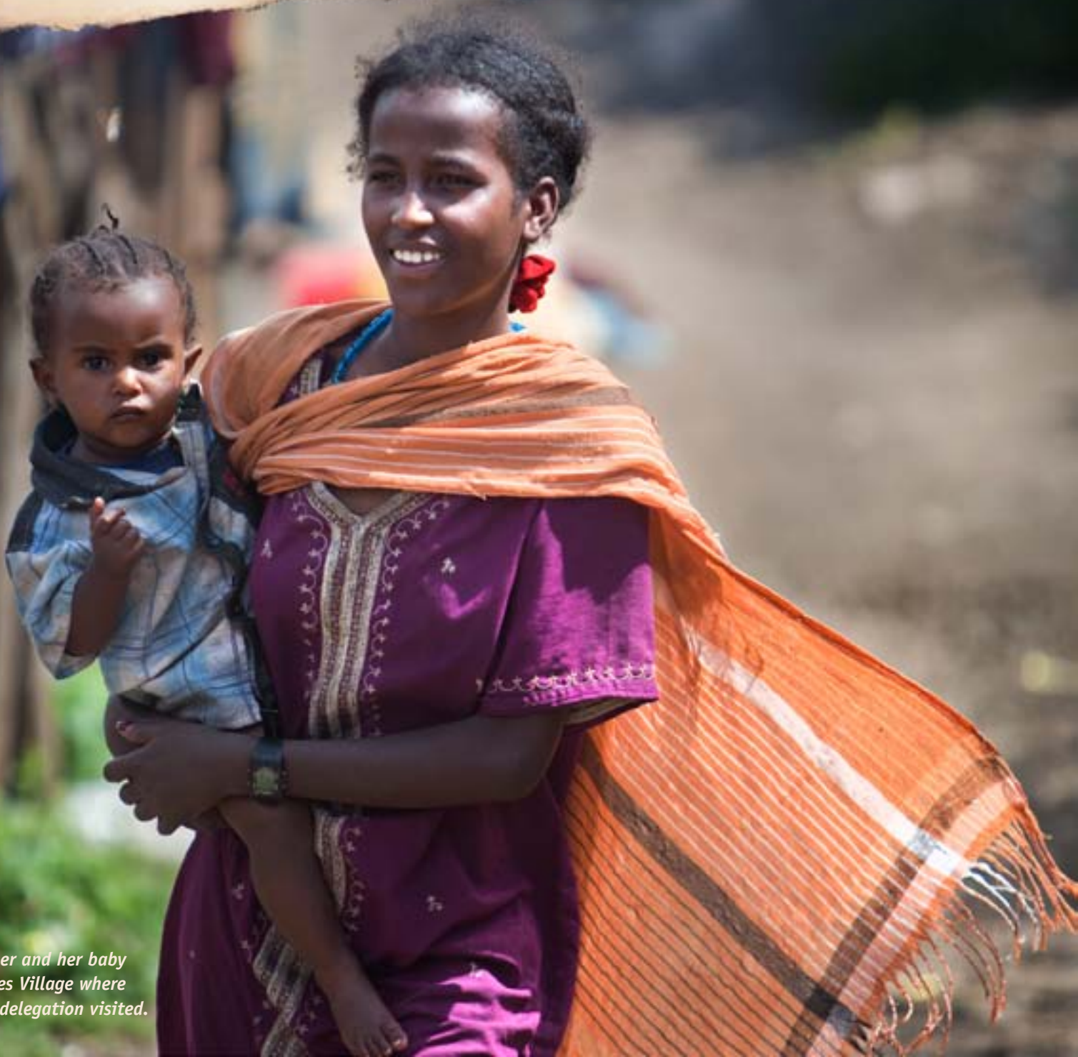
A mother and her baby at Hades Village where CARE's delegation visited.