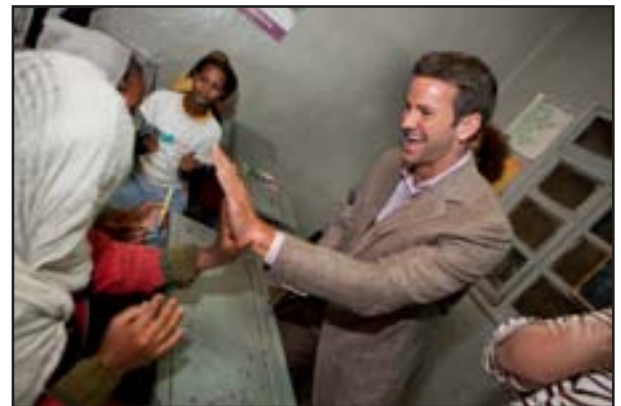
Representative Aaron Schock greets girls at Biruh Tesfa.