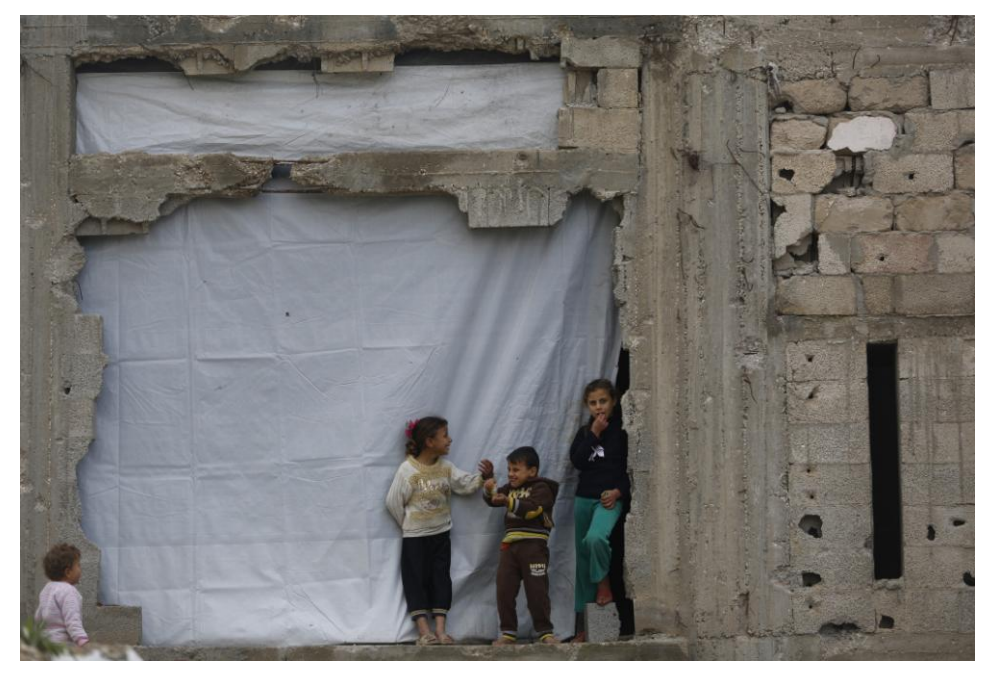
Young children at their damaged home in Beit Hanoun. Gaping holes in the walls are now covered with tarpaulin.

Norwegian Minister of Foreign Affairs Børge Brende, Opening Remarks, Cairo Conference