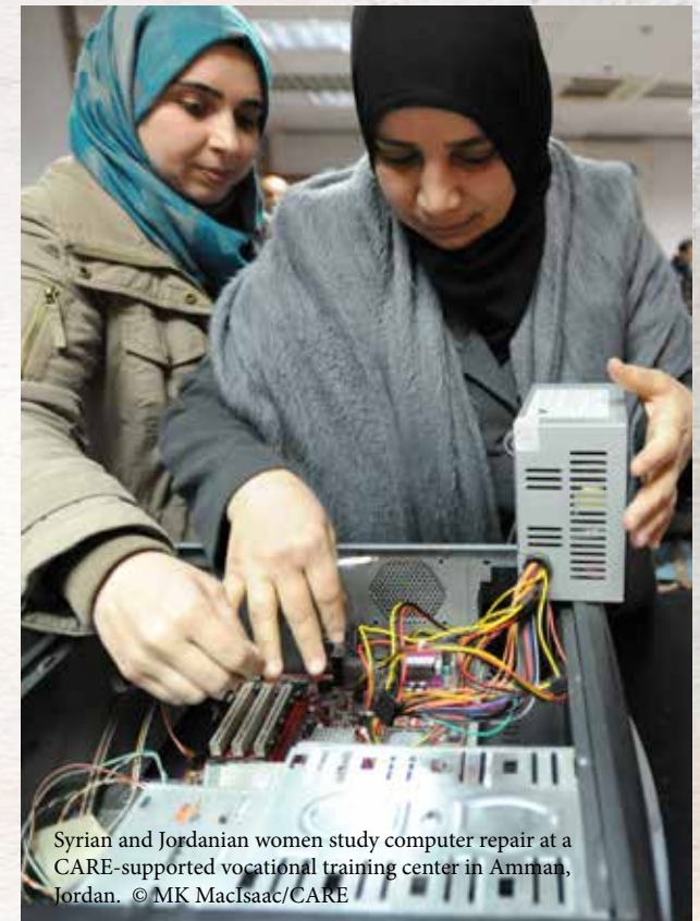
Syrian and Jordanian women study computer repair at a CARE-supported vocational training center in Amman, Jordan.