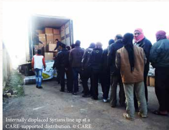
Internally displaced Syrians line up at a CARE-supported distribution.