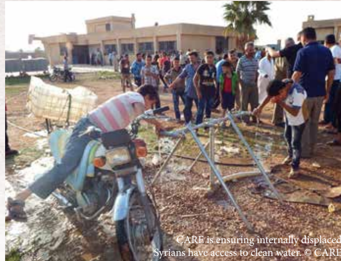
CARE is ensuring internally displaced Syrians have access to clean water.