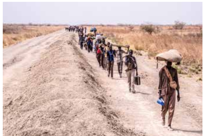
An armed group carries away looted goods from Malakal, Upper Nile State, February 2014.

It is as yet unclear what position the Kenyan authorities propose to adopt in regard to the situation in South Sudan. The commercial and security interests cited above suggest that Kenya has a strong interest in securing peace and stability. Assuming this to be the case, the figures reported for Somalia can be interpreted as a guide to how much a prolonged intervention may cost if the conflict in South Sudan were allowed to escalate significantly. We project that under the medium and high conflict scenarios, Kenya would incur an extra US$ 200 million in military expenditures.