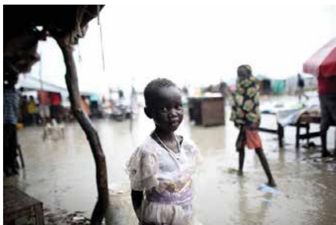
Protection of Civilians site at the UNMISS base in Bentiu, Unity state, July 2014.

As can be seen from the figures above, the overall cost of conflict in South Sudan to the neighbouring region 32 is approximately 32.3% of the region's total annual GDP under the 'high conflict scenario 2'. The potential consequences are particularly great for Kenya and Uganda, who are South Sudan's biggest trading partners.