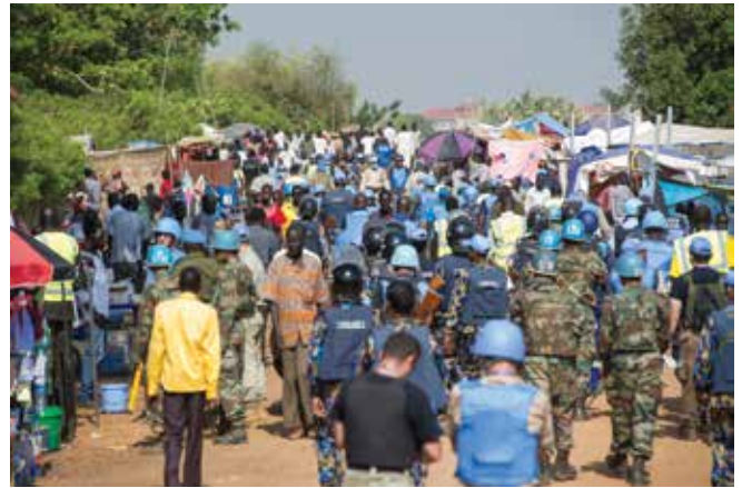
UNPOL enforces security measures at IDP camps in Juba. January 2014.

Finally, it needs to be emphasised that resource shocks exacerbate existing fragilities affecting prudent fiscal management. The government has recognised that poor fiscal discipline has led to an accumulation of domestic debt, including a large stock of domestic arrears that has yet to be precisely quantified. In his budget speech, the Minister of Finance acknowledged that defence requirements would be financed through borrowings from the China National Petroleum Corporation against future oil earnings 41 . He also stated planned contributions to the Oil Revenue Stabilisation Fund and the Future Generations Fund, which under the terms of the Petroleum Management Act were to account for 25% of gross oil earnings, would be deferred in order to release funds for current needs. 42 These developments further illustrate how conflict diverts resources to less socially productive uses and undermines improvements to economic governance.