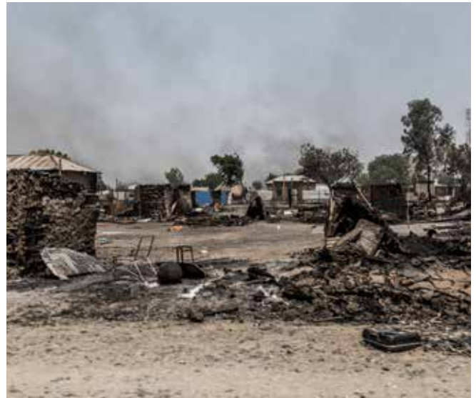
Destroyed homes burn in Malakal, Upper Nile State, February 2014.

Not all of these costs can be quantified, especially those in the last category. Hence the focus of the quantitative analysis is on the first two categories, with qualitative information on the third category used, where available, to supplement the discussion.