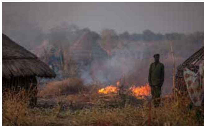
A "Nuer White Army" fighter stands in a burning field near Akobo, Jonglei State, February 2014.