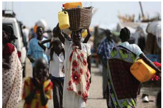
Protection of Civilians site at the UNMISS base in Bentiu, Unity state, July 2014.

Another key issue not dealt with in the analysis presented is the social cost of the conflict for this young nation, just emerging from nearly two decades of brutal war with Sudan. The political violence unleashed in December 2013 has been especially damaging because it has targeted the most vulnerable groups: women, children, the elderly and disabled. The pervasive use of sexual and gender-based violence against women and girls is one manifestation of the unravelling of social norms and values that has characterized this conflict. Others include the weakening of traditional social safety nets, the adverse impact on people's sense of dignity and pride, and the palpable sense of mistrust amongst people who only months ago were neighbours. They indicate that South Sudan will need ongoing support and assistance from its neighbours and the international community to develop ways of reconnecting people with their sense of belonging in society. This reconnecting needs to happen at the individual level, but it is also critical to ensure the country as a whole can undergo the kind of social, psychological and economic transformation necessary to achieve lasting peace and reconciliation.