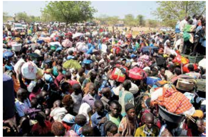
Civilians fleeing the fighting and seeking refuge, wait outside a compound of the UN Mission in Bor (December 2013).

In the following sections, we explain the methodology we use to relate the baseline and conflict scenarios, respectively, to each of the three cost categories identified.