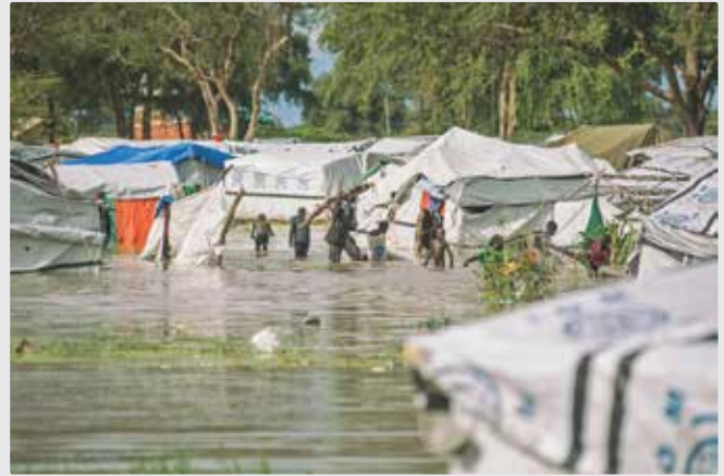
UN Peacekeepers help move families from a flooded "Protection of Civilians (PoC)" site to a new site at the UNMISS base in Bor. October 2014.

7.2 The National Unity Government will need to work with the financial and technical support of the international community to lay strong foundations for a new South Sudan that is stable, democratic and prosperous.