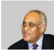
Dr. Salim Ahmed Salim

Former Minister of Foreign Affairs, Minister of Defence, Prime Minister of the United Republic of Tanzania and Secretary General of the Organisation of African Unity.