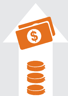
FIGURE 1: Results from TESFA 2010-2013

CARE launched TESFA (which means 'hope' in Amharic) in 2010, aiming to mitigate the challenges faced by married adolescent girls in South Gondar zone of the Amhara region of Ethiopia. TESFA impacted the lives of 5,000 girls with the goal of achieving measurable positive change in their economic empowerment (EE) and sexual and reproductive health (SRH) status. TESFA used an integrated intervention combining CARE's successful Village Savings & Loan Associations (VSLA) model within peer-led girls' groups to strengthen both SRH and EE outcomes and Social Analysis & Action (SAA) groups to engage community members to address the social normative barriers faced by ever-married girls. See figure 1 for results from the implementation of TESFA in 2010-2013, from the evaluation conducted by International Center for Research on Women (ICRW).