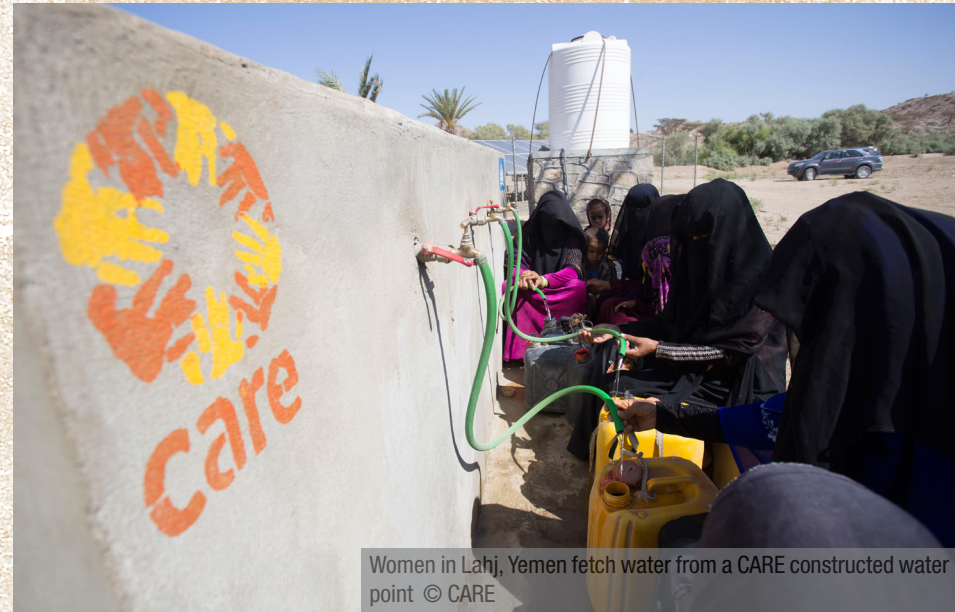
Women in Lahj, Yemen fetch water from a CARE constructed water point