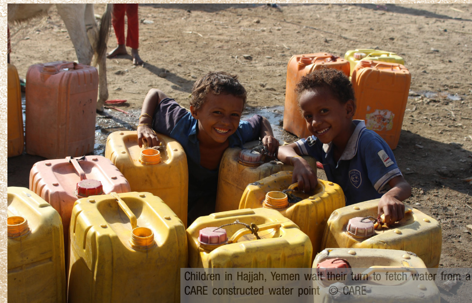
Children in Hajjah, Yemen wait their turn to fetch water from a CARE constructed water point