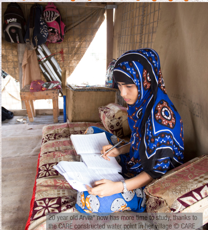
20 year old Arwa* now has more time to study, thanks to the CARE constructed water point in her village

While Yemen is a challenging and dynamic context for humanitarian operations and programming, there are opportunities and possibilities for impact and change by actors on the ground. In 2016, over 100 humanitarian agencies were operational across 5 Hubs in Yemen and as of October 2016, had assisted 4.6 million people across the country.