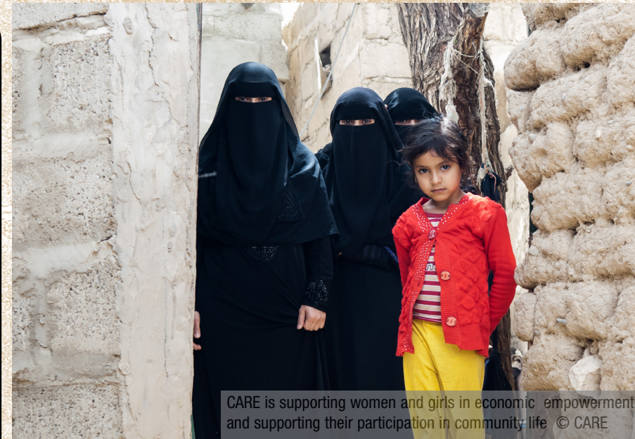
CARE is supporting women and girls in economic empowerment and supporting their participation in community life