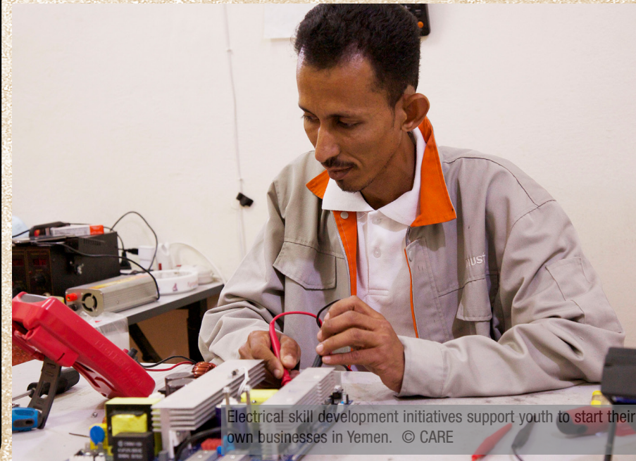
Electrical skill development initiatives support youth to start their own businesses in Yemen.