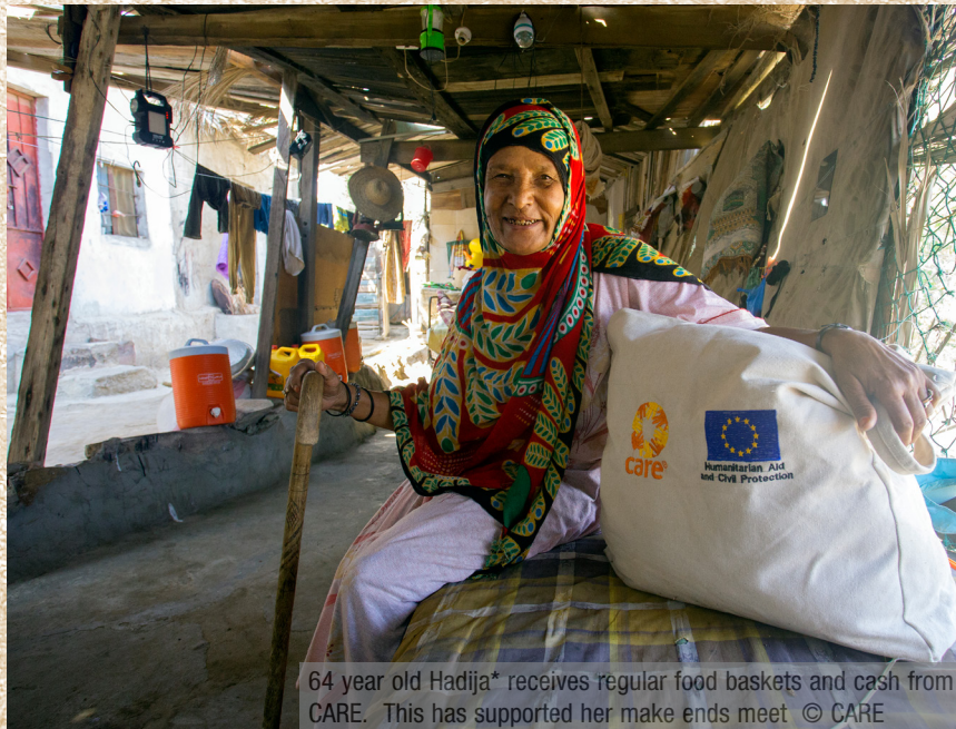
64 year old Hadija* receives regular food baskets and cash from CARE. This has supported her make ends meet

Food insecurity in Yemen is not only a result of the conflict and insecurity, it has been made worse by a dwindling economy, restrictions on food imports, disruption of markets and the lack of regular income opportunities for a vast majority of the population.