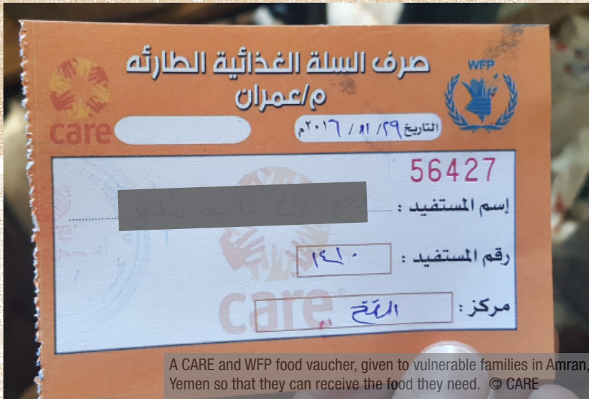
A CARE and WFP food voucher, given to vulnerable families in Amran, Yemen so that they can receive the food they need.