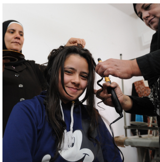
Syrian refugee women attend vocational training in hairstyling at a CARE Urban Refugee Center in Hashimi in East Amman.

Many Syrian men have been killed or disappeared, and families have been separated. Many more men have sustained serious injury – both physical and psychological – or are otherwise unable to provide for their families. The result has been a difficult, but profound and potentially transformative change for women, many of whom have been faced with situations in which they need to be the primary breadwinner for their family. A 2019 study found that 31% of women in Syria reported having taken on new roles and responsibilities since the conflict began, and these new responsibilities come with some degree of autonomy. 16 The same study found that if women contribute to the family's income, the likelihood of being able to be part of family decision-making processes roughly doubles. 17