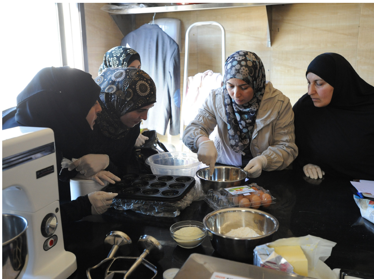
Syrian, Lebanese, and Palestinian women learn together during a pastry-making course at a CARE-supported vocational training center in Tripoli, Lebanon.

“These new circumstances have put me in the position of being both mother and father for my children, and this applies to most women in my community... The current situation supports women’s empowerment and the idea that she is equal to men, but the reality is that she took on the role of both males and “I used to be a housewife in the past, a mother and a lady in my community, but afterward, I became like females simultaneously. Now she does both” (Woman, 35, Raqqa, Displaced). 24