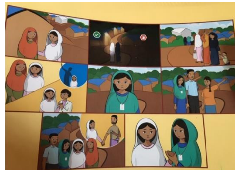
Figure 1. CARE's Visual outreach job aids