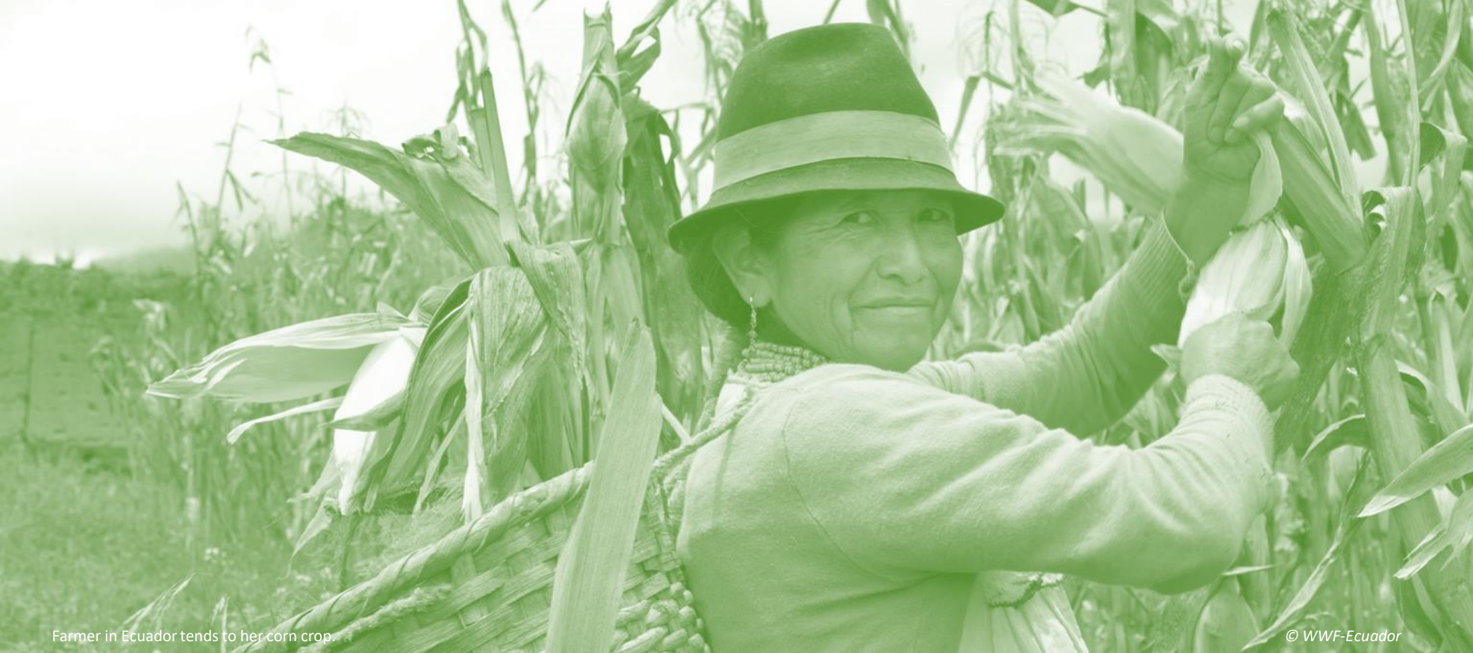
Farmer in Ecuador tends to her corn crop.