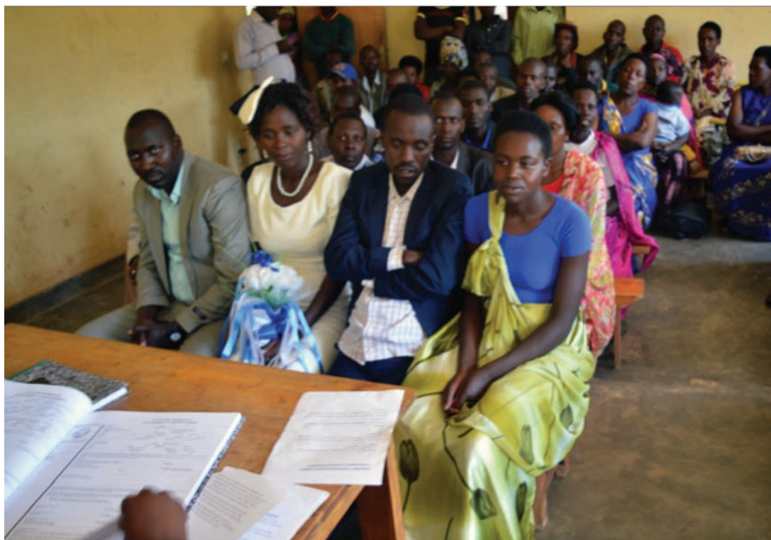
A sub-set of some of the trained couples who as a collective group legalized their marriages after the curriculum.

RWAMREC staff continued to meet with the trained couples for the duration of the programme, to support their relationships and community responses, including referral processes.