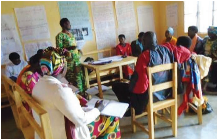
A group discussion as part of the couples' curriculum.

I ntimate partner violence (IPV) is the most common form of violence against women, with an estimated one in three women having experienced partner physical or sexual violence in their lifetime. 1 The Indashyikirwa programme in Rwanda is an intervention that aims to prevent IPV and support healthy, equitable relationships through a participatory couples curriculum and community activism activities. The programme has been rigorously evaluated through research conducted with couples in the intervention. This practice brief highlights lessons learned from working and conducting research with couples to prevent IPV.