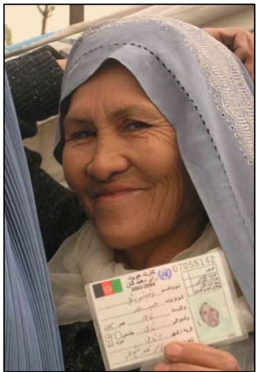
A voter in the 2004 presidential election.

Afghanistan remains very fragile. Insecurity has increased over the summer and, in some rural areas, there is less willingness to wait peacefully for the pledges regarding enhanced security and greater opportunity to be fulfilled by the Afghan Government, with assistance from the international community.